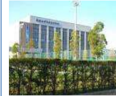
名城大學 Meijo University