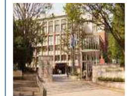
筑波大學 University of Tsukuba