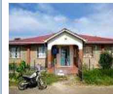
長崎大學 University of Nagasaki