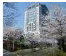
創價大學 Soka University