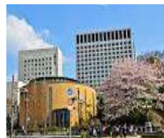
上智大學 Sophia University