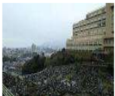
志學館大學 Shigakukan University