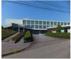
國際教養大學 Akita International University