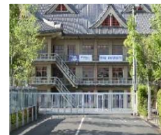
天理大學 Tenri University