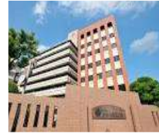
京都外國語大學 Kyoto University of Foreign Studies