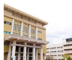
京都女子大學 Kyoto Women's University