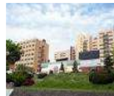
帝京大學 Teikyo University