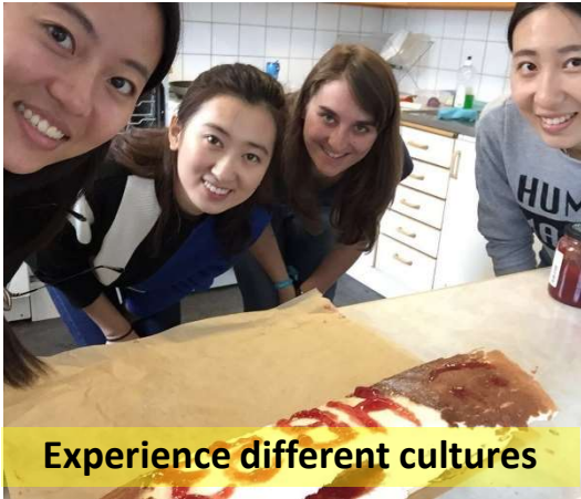
Experience different cultures