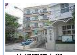
沖繩國際大學 Okinawa International University