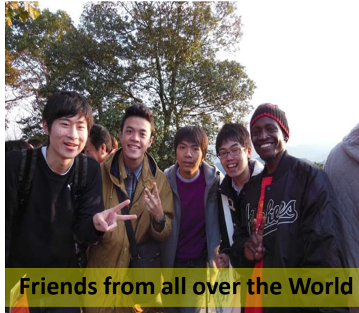
Friends from all over the World