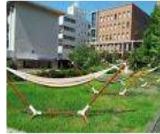
櫻美林大學 J. F. Oberlin University