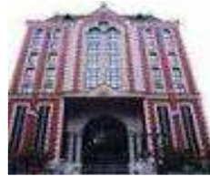
慶應義塾大學 Keio University