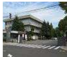
福井大學 University of Fukui