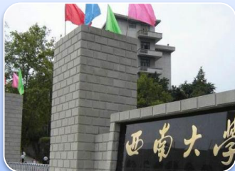
Southwest University (China) 西南大學 (中國)

A key comprehensive university with unique strengths in oceanography and fisheries 海洋與漁業獨特優勢的重點綜合性大學