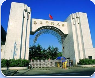
East China Normal University (China) 華東師範大學 (中國)

Focus on talent training, scientific research, community service, and international exchanges 注重人才培養、科學研究、社區服務及國際交流