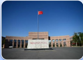
University of Chinese Academy of Social Sciences (China) 中國社會科學院大學 (中國)

Equipped with the most comprehensive setup of disciplines in humanities and social sciences 設有最齊全的人文社會科學學科設置