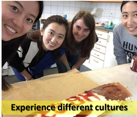
Experience different cultures