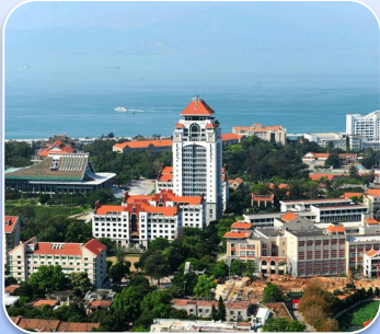
Xiamen University (China) 廈門大學 (中國)

北京大學是中國第一所覆蓋綜合學科的國立大學，自成立以來一直是中國領先的高等教育機構。