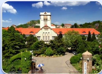
Ocean University of China (China) 中國海洋大學 (中國)

Equipped with the most comprehensive setup of disciplines in humanities and social sciences 設有最齊全的人文社會科學學科設置