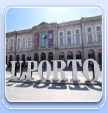
University of Porto (Portugal) 波爾圖大學 (葡萄牙) Leading teaching and scientific research in Portugal over 100 years 100多年來引領葡萄牙的教學和科研