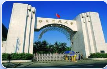
East China Normal University (China)