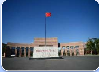
University of Chinese Academy of Social Sciences (China) 中國社會科學院大學 (中國)

Equipped with the most comprehensive setup of disciplines in humanities and social sciences 設有最齊全的人文社會科學學科設置