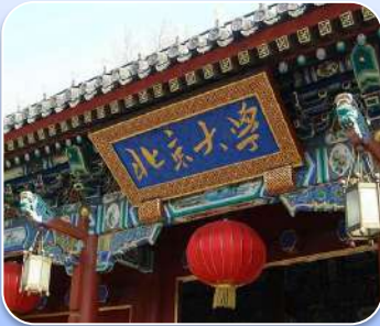
Peking University (China)