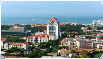
Xiamen University (China)

北京大學是中國第一所覆蓋綜合學科的國立大學，自成立以來一直是中國領先的高等教育機構。