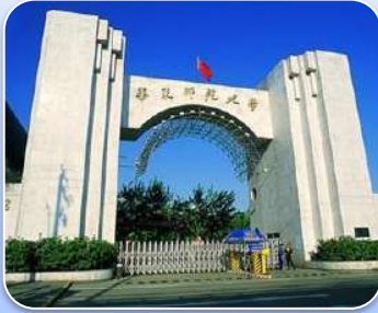
East China Normal University (China) 華東師範大學 (中國)

Focus on talent training, scientific research, community service, and international exchanges