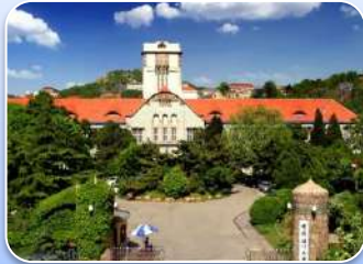
Ocean University of China (China) 中國海洋大學 (中國)

Equipped with the most comprehensive setup of disciplines in humanities and social sciences 設有最齊全的人文社會科學學科設置