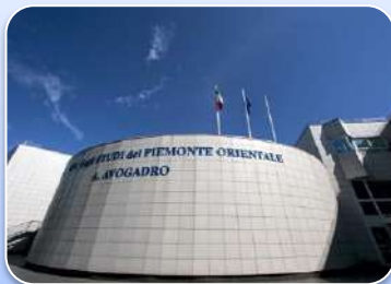
University of Eastern Piedmont (Università del Piemonte Orientale) (Italy)