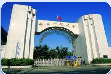
East China Normal University (China)