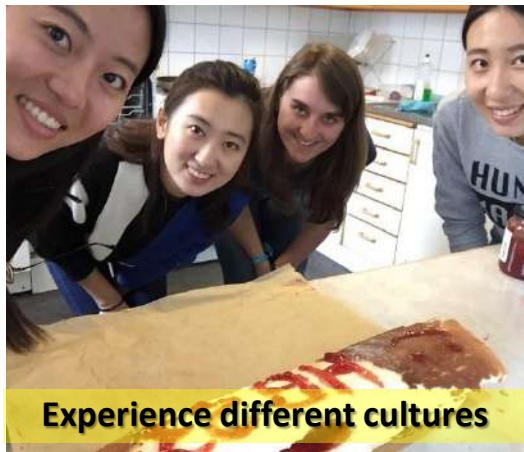
Experience different cultures