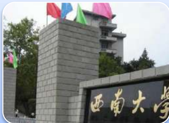
Southwest University (China) 西南大學 (中國)

A key comprehensive university with unique strengths in oceanography and fisheries 海洋與漁業獨特優勢的重點綜合性大學