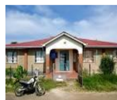
長崎大學 University of Nagasaki