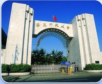
East China Normal University (China) 華東師範大學 (中國)

Focus on talent training, scientific research, community service, and international exchanges