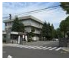
福井大學 University of Fukui