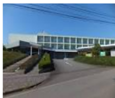
國際教養大學 Akita International University