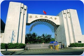
East China Normal University (China)