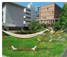
櫻美林大學 J. F. Oberlin University