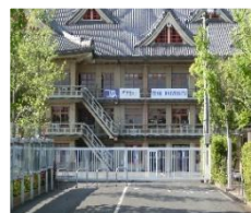
天理大學 Tenri University