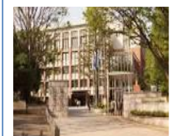
筑波大學 University of Tsukuba