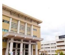
京都女子大學 Kyoto Women's University