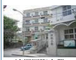
沖繩國際大學 Okinawa International University