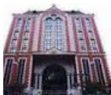
慶應義塾大學 Keio University