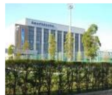
名城大學 Meijo University