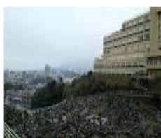
志學館大學 Shigakukan University