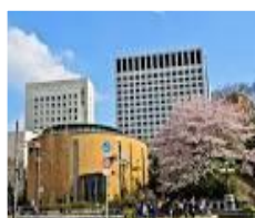
上智大學 Sophia University