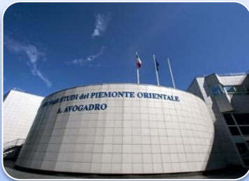
University of Eastern Piedmont (Università del Piemonte Orientale) (Italy)