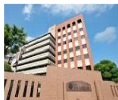
京都外國語大學 Kyoto University of Foreign Studies