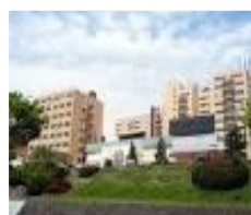
帝京大學 Teikyo University