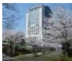
創價大學 Soka University